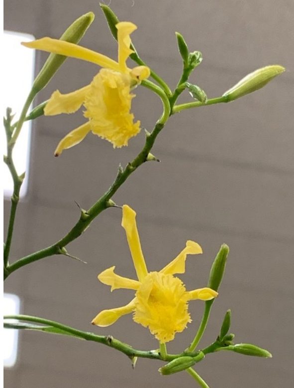
Sobralia dorbignyana 'Windflower'