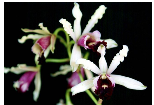
Myrmecophila (Schom.) albopurpurea

This month's opportunity table will be provided by one of our local orchid nurseries.